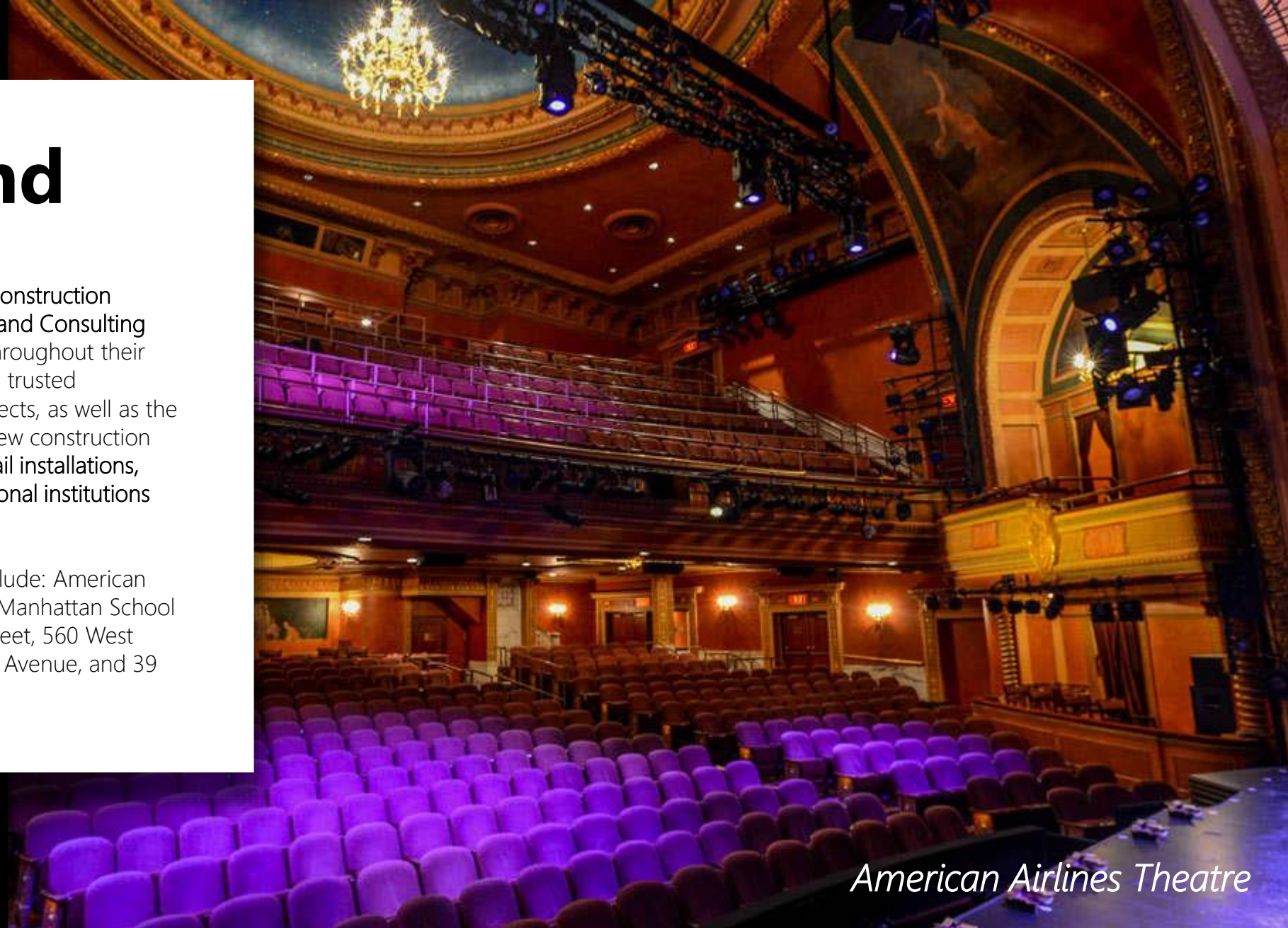
American Airlines Theatre

Major projects, past and present, include: American Airlines Theatre, Laura Pels Theatre, Manhattan School of Music, Duke 42, 221 West 77th Street, 560 West 24th Street, 1711 1st Avenue, 540 6th Avenue, and 39 W 23rd Street